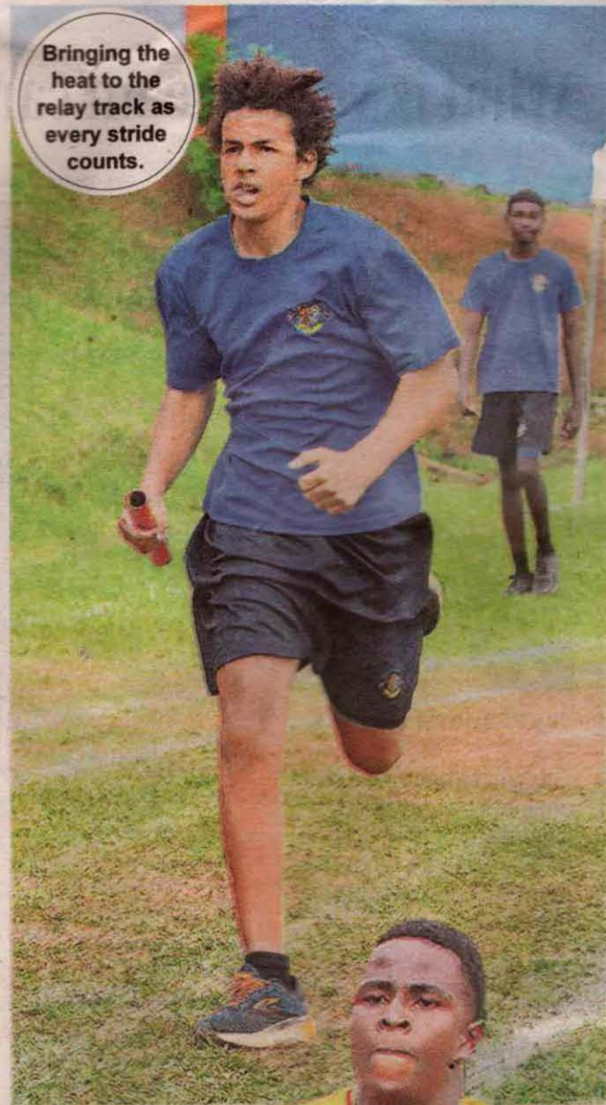
Bringing the heat to the relay track as every stride counts.