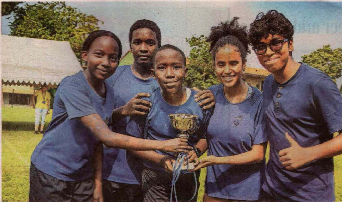
The energy, unity, and house pride shone through every game that Kyoga House, the Spirit Cup winners, took part in.