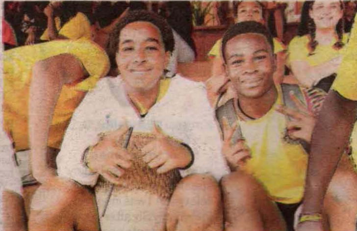
Smiles, cheers, and team pride! Students show their full support from the stands during the event.