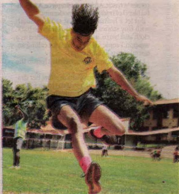
Defying gravity! Taking flight for Impala House.