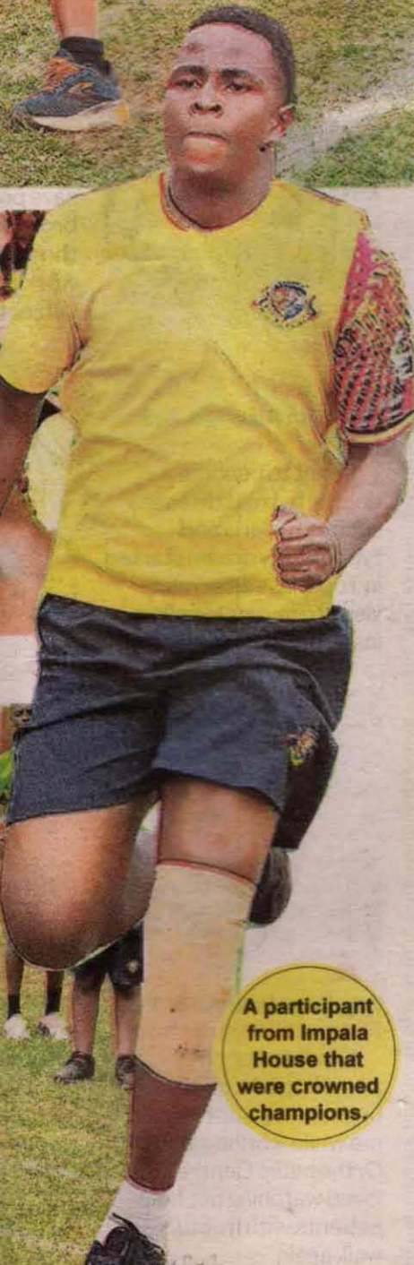
A participant from Impala House that were crowned champions.