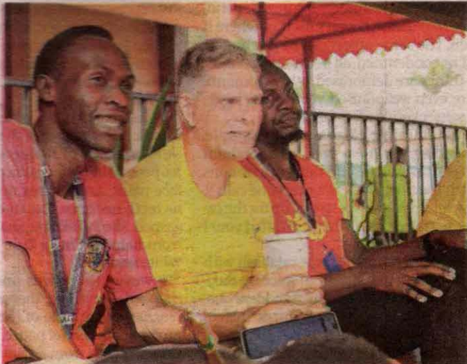
Full of spirit: Staff enjoy the thrilling action and celebrate the talent on display.