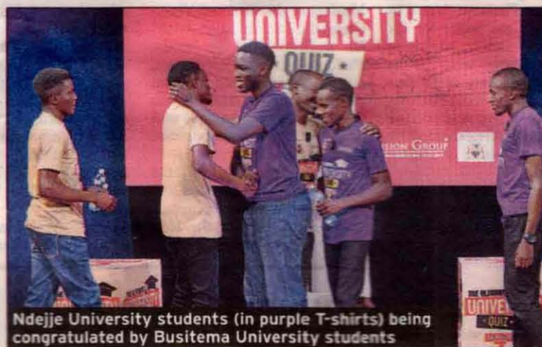
Ndejje University students (in purple T-shirts) being congratulated by Busitema University students

sharp answers on ancient kingdoms and lusophone nations, but Ndejje maintained its slim edge.