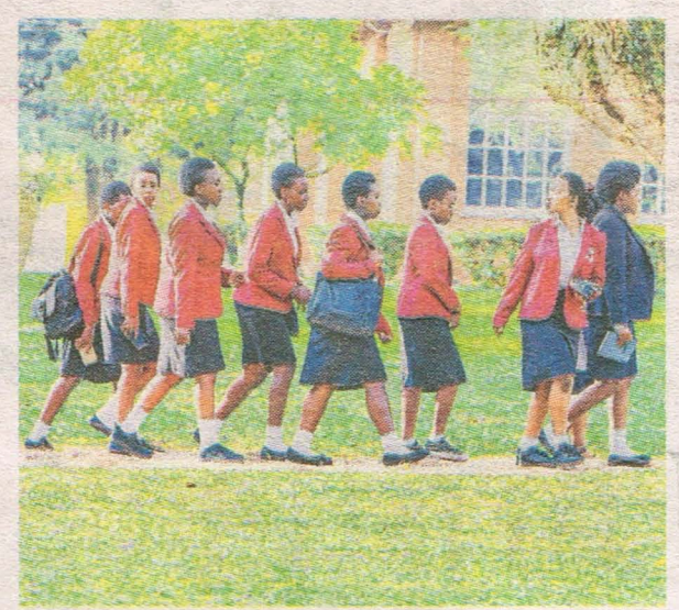
When NDC said the championship is legit, Immaculate Heart Girls took it 'Personal.'

It is never about age, your coach could be as young or even younger; JOVOC team with their patron after a round.