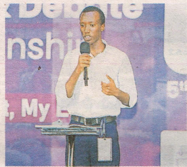
A student from CHAAPA delivers his whip speech.