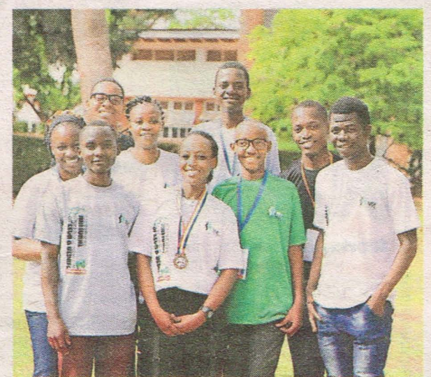
The family spirit—students of Code High School share a light moment before departure.