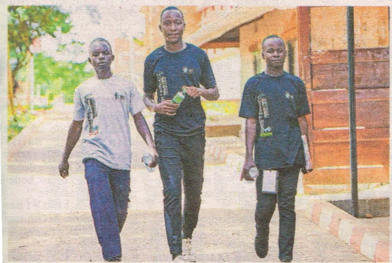
A confident walk out of the debate room doesn't take away your rights.