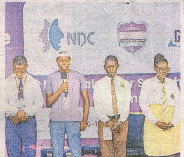
Student representatives leading preliminaries at the Awards Ceremony on December 10.

Media Club Youngsters display their Creative performance and artistry during the finals.