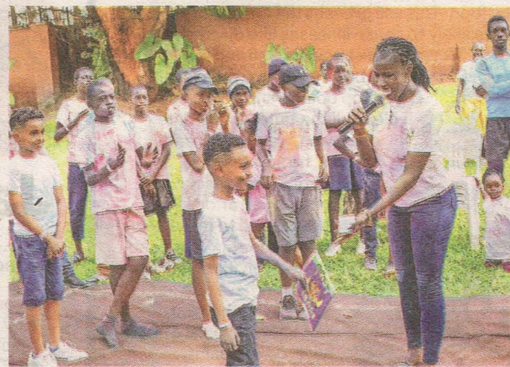
The different winners in the Spelling Bee competition were awarded books to read.