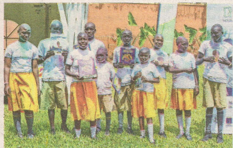
Pupils from Nakasero School of the Blind enjoy a photo moment after receiving books.