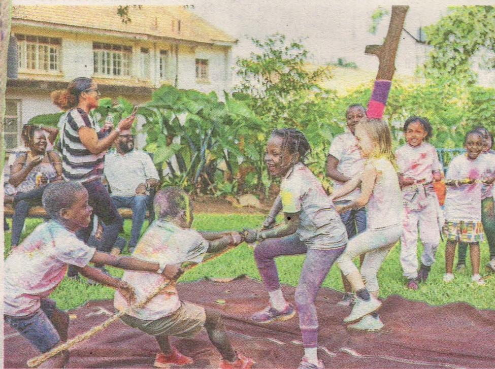
Participants take part in a tug of war contest.