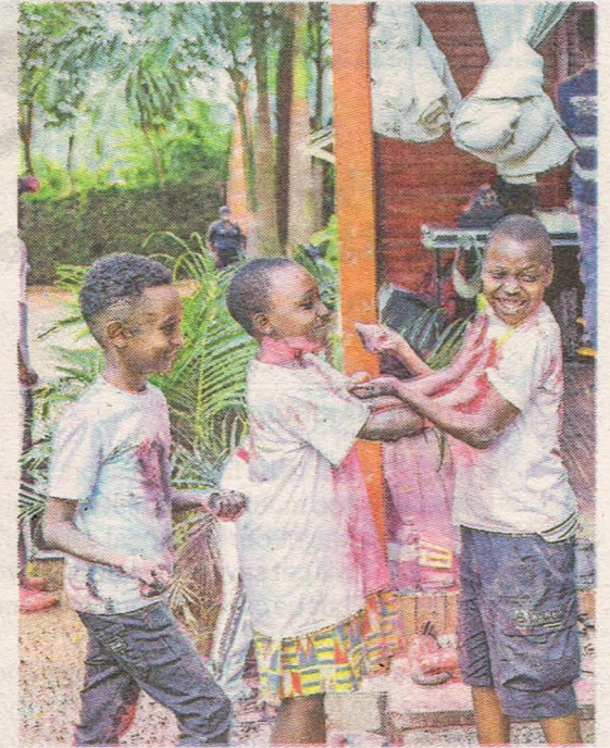
Children having a colour splash party time.