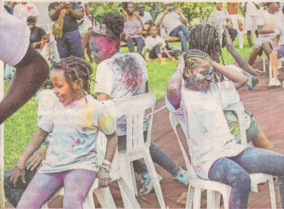
Musical chairs were fun too.