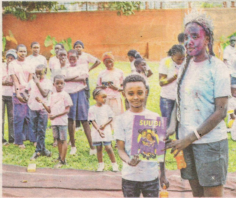
A child receives a copy of a book after wining in the Spelling Bee competitions.