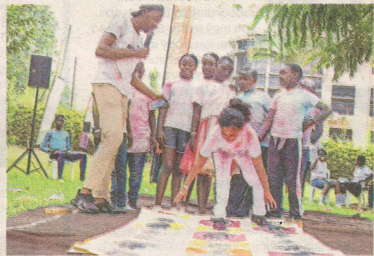
Children take part in a puzzle game.