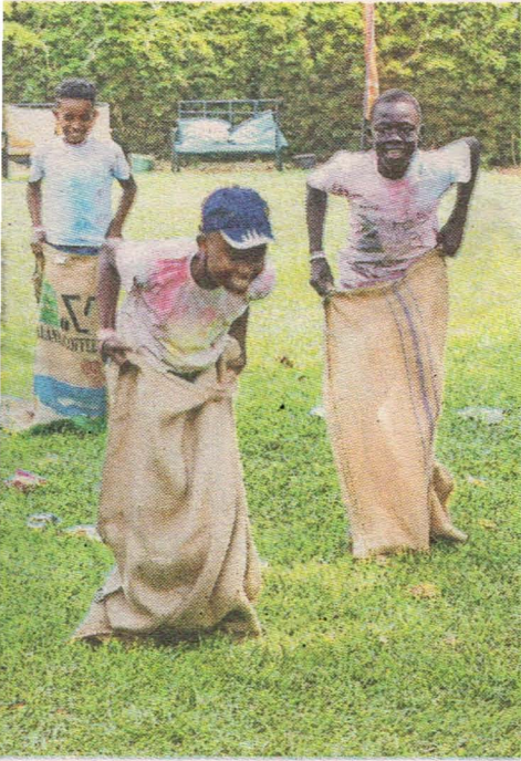
Racing for fun in sacks.