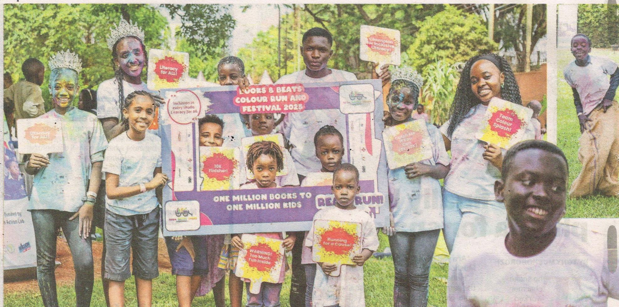
Some of the children display their reasons for attending the festival.