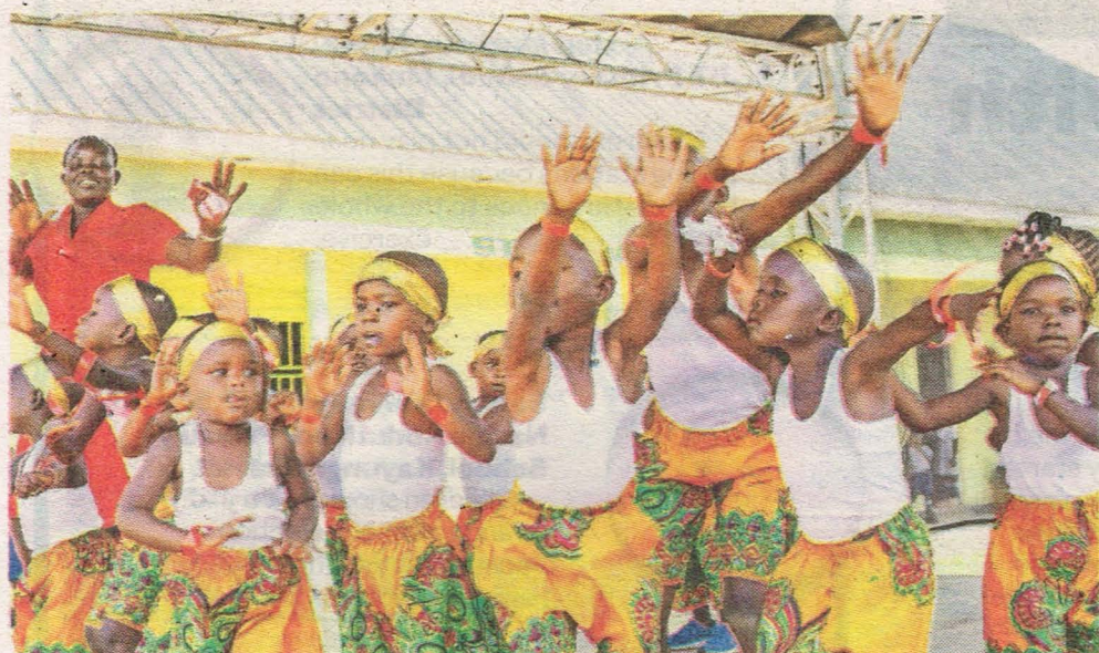
Baby Class pupils present a creative dance.