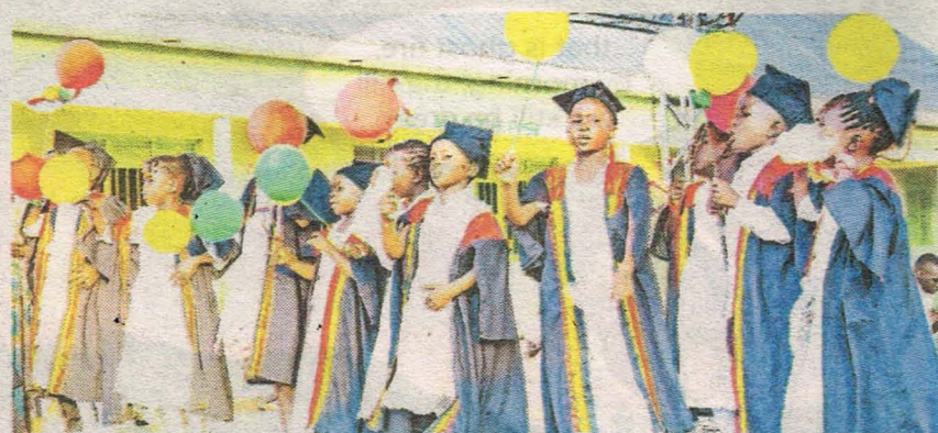
Top Class graduands present their mime on stage.