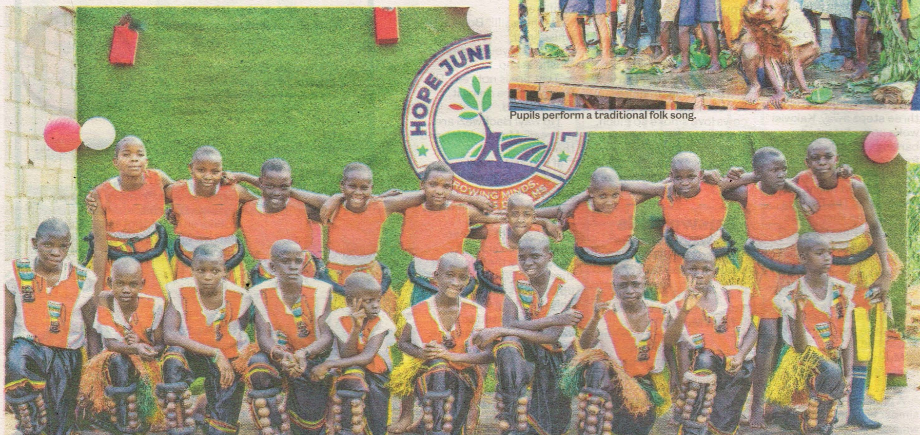
Learners take a group photo after performing the Lunyege dance.