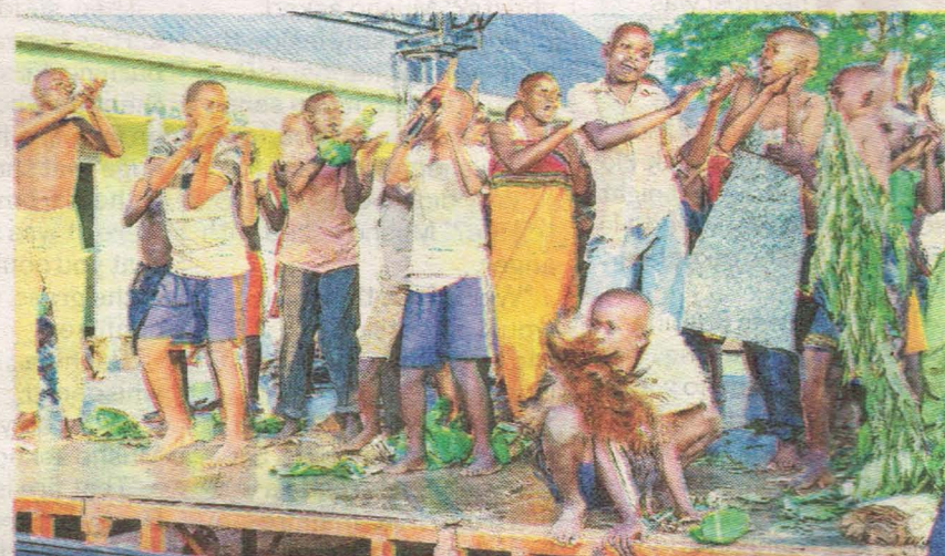
Pupils perform a traditional folk song.