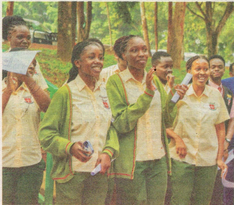
Students celebrate their peers' results during the event.