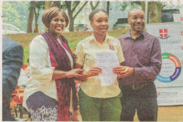
Parents share their child's excitement after receiving her results.