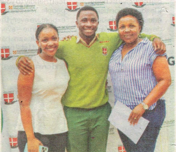
When good results are a family affair...