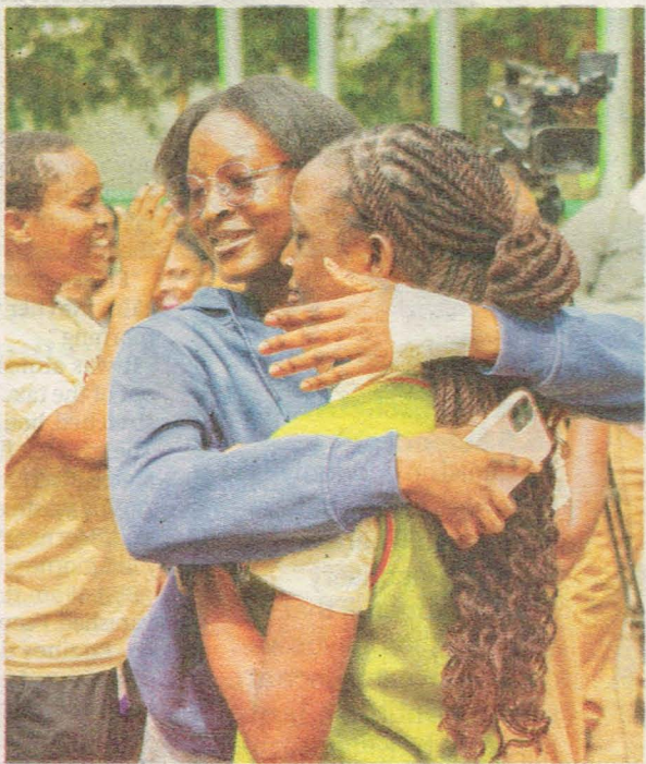
Warm congratulations for having performed well.