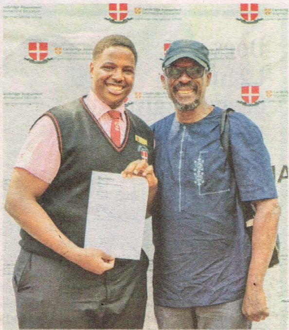
A student celebrates with his guardian after the release of the exams.