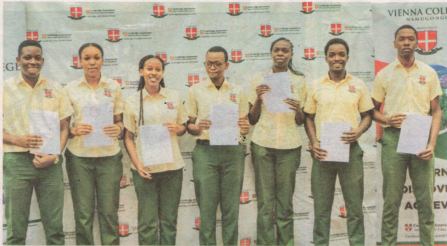
Some of the students display their results at the school during the celebrations.