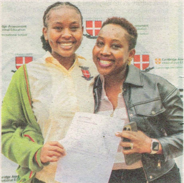
An excited parent shows off the results of their student.