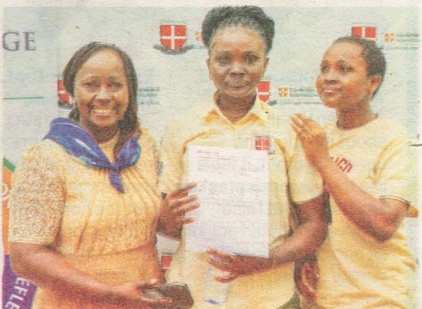
A student shows off her good grades.