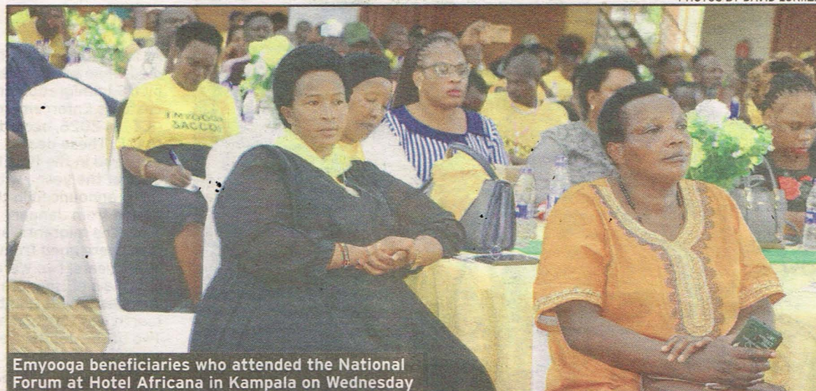
Emyooga beneficiaries who attended the National Forum at Hotel Africana in Kampala on Wednesday