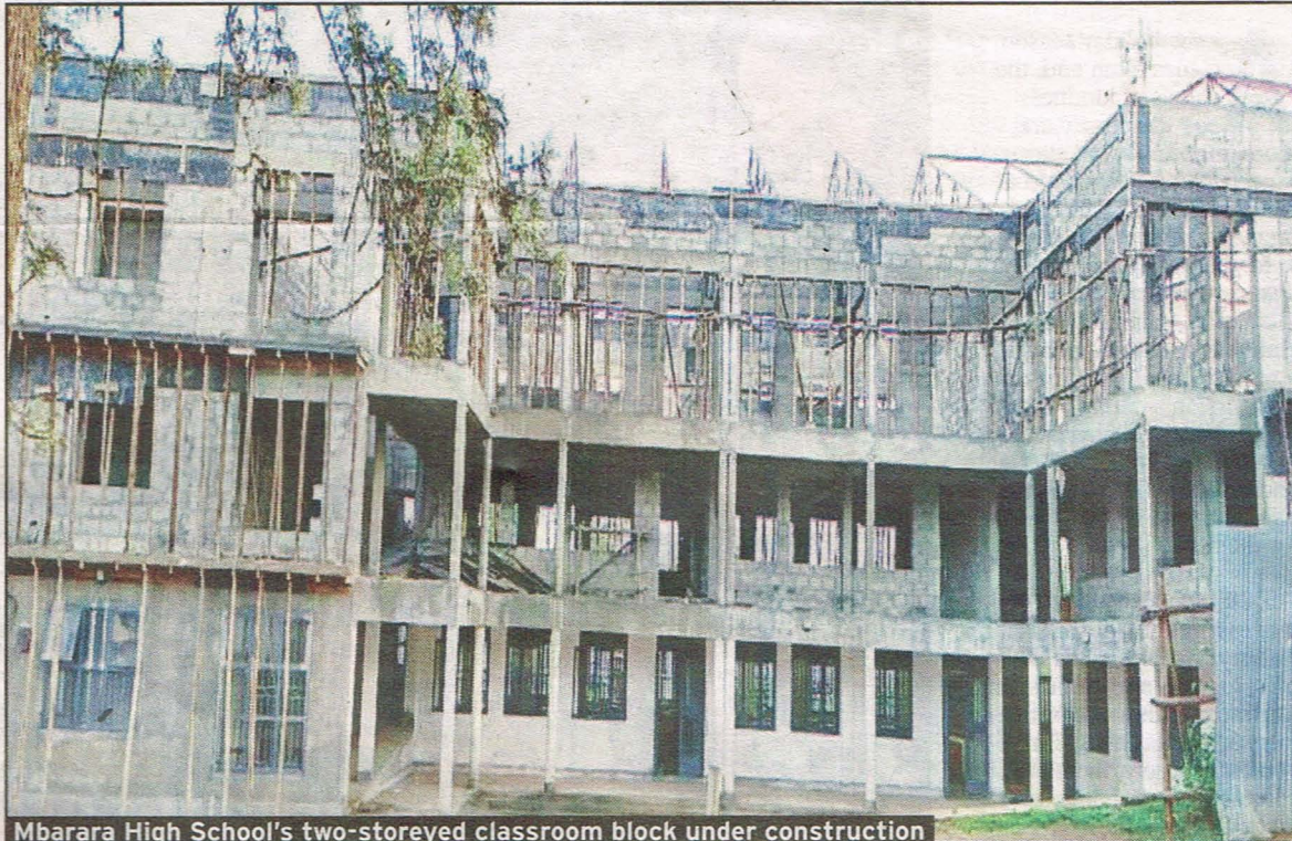
Mbarara High School's two-storeyed classroom block under construction