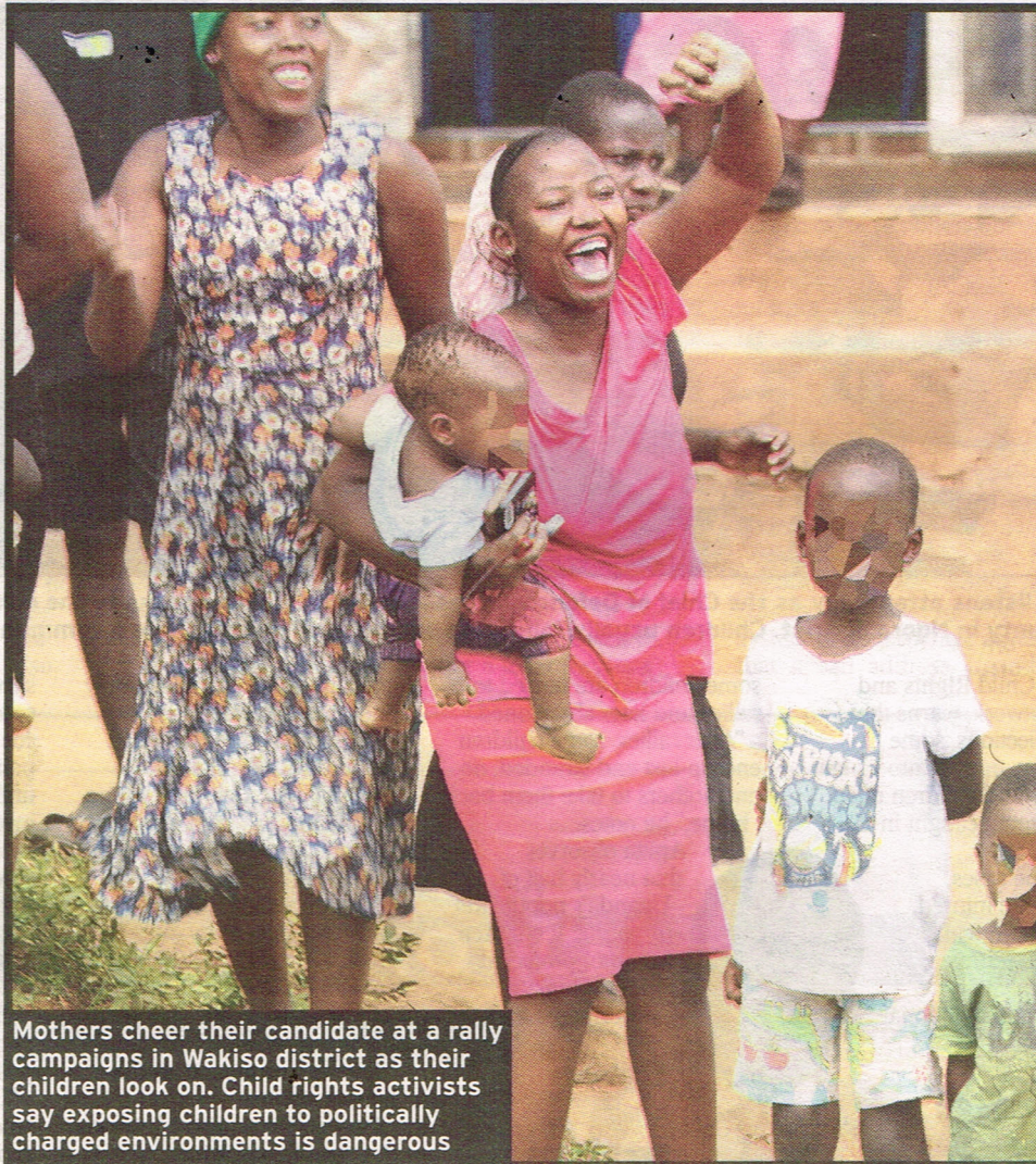
Mothers cheer their candidate at a rally campaigns in Wakiso district as their children look on. Child rights activists say exposing children to politically charged environments is dangerous

Tumuramy cautions parents to mind what they say around children, adding that they [parents] play a crucial role in preventing such ideas from being ingrained in the minds of children (see full article on page