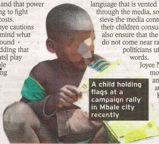
A child holding flags at a campaign rally in Mbale city recently

Lubulwa believes political leadership is a serious responsibility and that children should be raised with strong values, not exposed