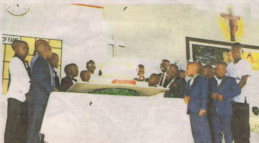
The boys cut cake after Mass to mark the day.