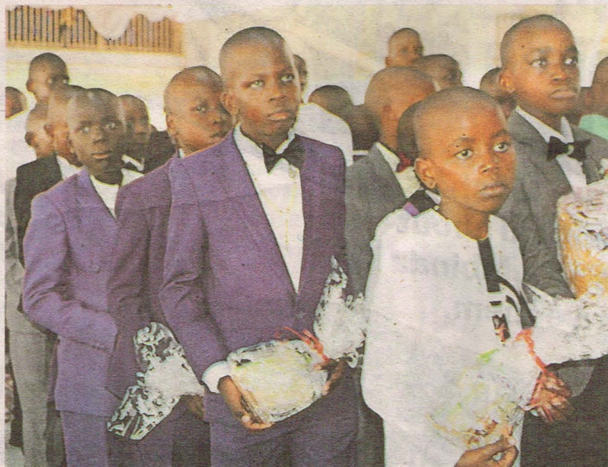
Pupils carry offertory during Mass.