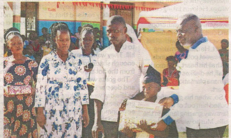
The guest of honour hands over a certificate to one of the Top Class pupils who graduated.