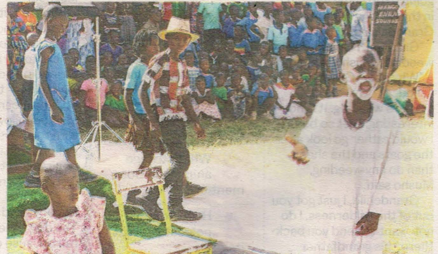
Learners perform a skit during the function.