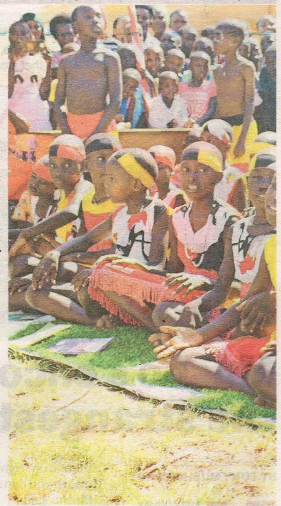
Pupils perform a traditional folk song.