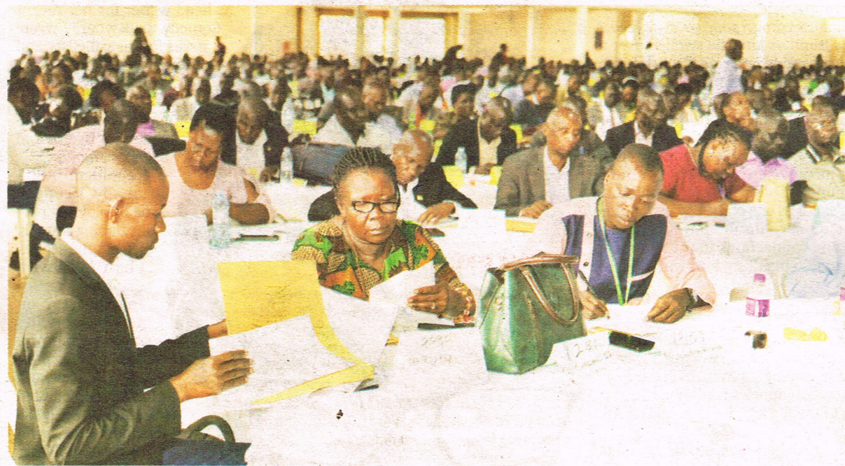
Headteachers from different secondary schools take part in the Senior One selection exercise at UMA multipurpose hall in Lugogo, Kampala City, last February.

Another 388,293 candidates passed in Division Two from the 2025 cohort compared to 397,589 who wrote their final papers in 2024. A total of 165,226 candidates were in Division Three, while 84,724 passed in Division Four.