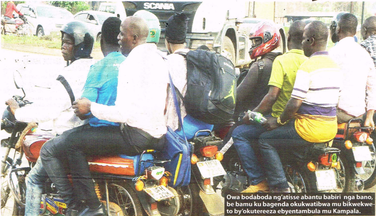
Owa bodaboda ng'atise abantu babiri nga bano, be bamu ku bagenda okukwatibwa mu bikwekwe by'okutereza ebyentambula mu Kampala.