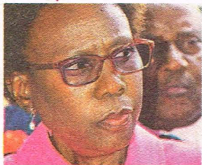
Dr Jane Ruth Aceng, Health minister

The facility has the highest number of production for babies. It is very critical to have oxygen so that every mother can walk back home with a baby.