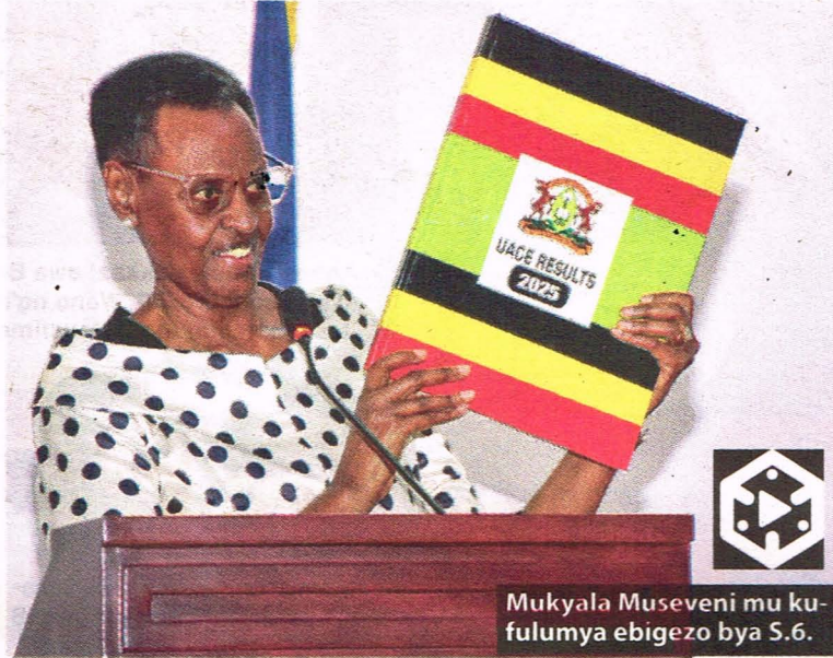
Mukyala Museveni mu kufulumya ebigezo bya S.6.

Yasanyukidde eky'abawala abakola ssaayansi okweyongera, ate ng'ekizzaamu amaanyi bakola