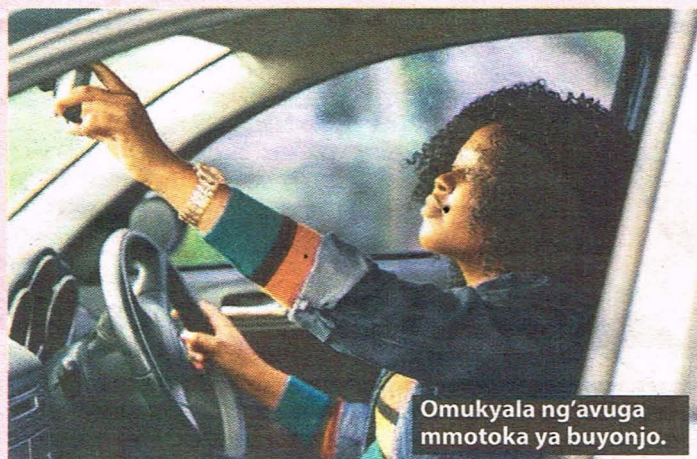
Omukyala ng'avuga mmotoka ya buyonjo.

Munnayuganda eyaweebwa ekirabo ky'emmotoka mu America bw'agireeta kuno asasula omusolo?