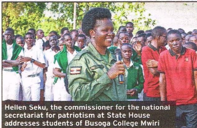
Hellen Seku, the commissioner for the national secretariat for patriotism at State House addresses students of Busoga College Mwiri

A student of Busoga College Mwiri has appealed to the Government to consider appointing a presidential advisor specifically for secondary schools. The appeal was made during an official visit by the commissioner for the national secretariat for patriotism at state house, Hellen Seku.