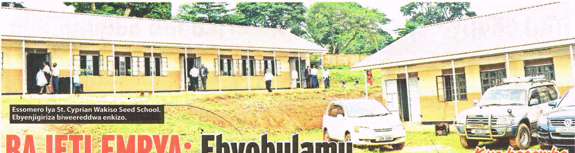
Essomero Iya St. Cyprian Wakiso Seed School. Ebyenjigiriza biweereddwa enkizo.