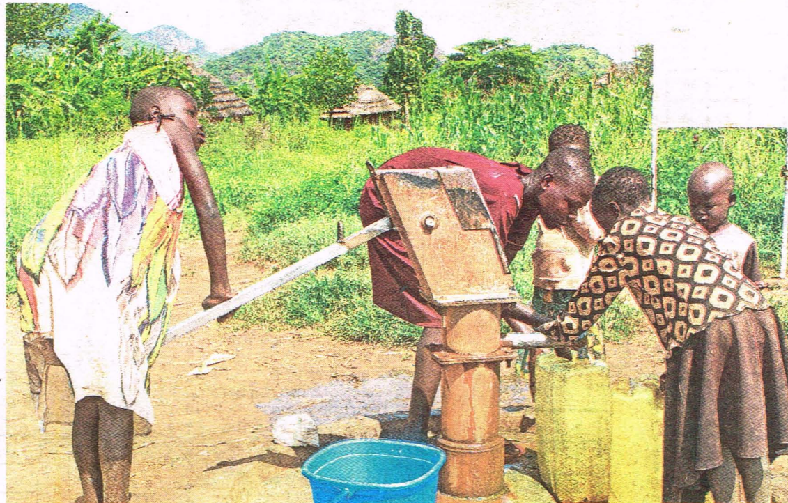
Children drawing water from a borehole in Kanu village, Abim district. All children have a right to access clean water to live a healthy life.

have well-built toilets and piped water, some children still choose to ease themselves in the bushes.