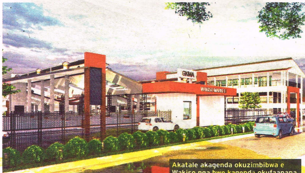
Akatala akagenda okuzimbibwa e Wakiso nga bwe kagenda okufaanana.