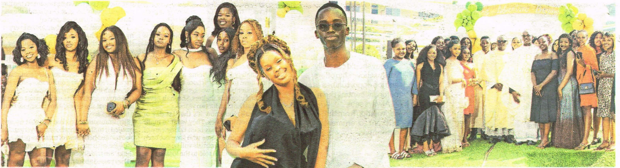
The ladies turned heads with their stunning prom ensembles.

Beyond entertainment, the Aurelia Soirée Prom 2026 stood out for blending structured tradition with modern student culture, positioning the cocktail session as a relaxed networking space that encouraged interaction and creativity.