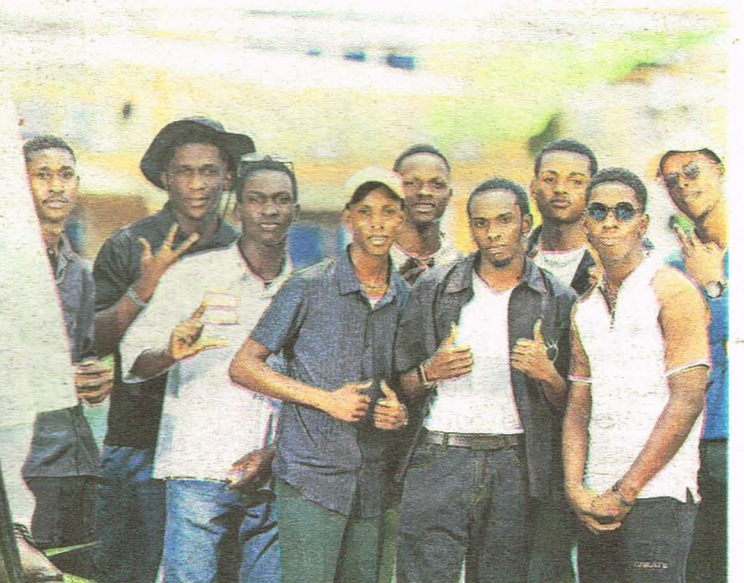
Cool poses and bold brotherhood on full display.