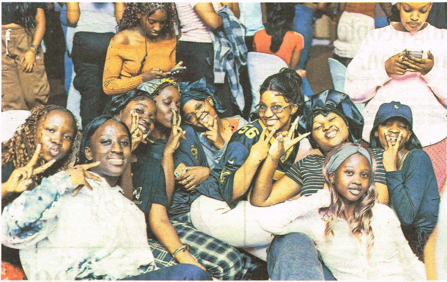
Confidence, friendship and a little playful attitude captured in one hell of a frame.